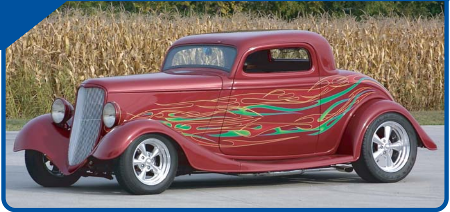
1933 Ford Three Window Coupe

Noise Eliminated: 17.6dB Temperature Decreased: 151° F Material Cost: $1,729.65 Installation Time: -Expert: 7.0 hours -Average: 9.0 hours -Novice: 11.0 hours