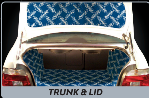
TRUNK & LID